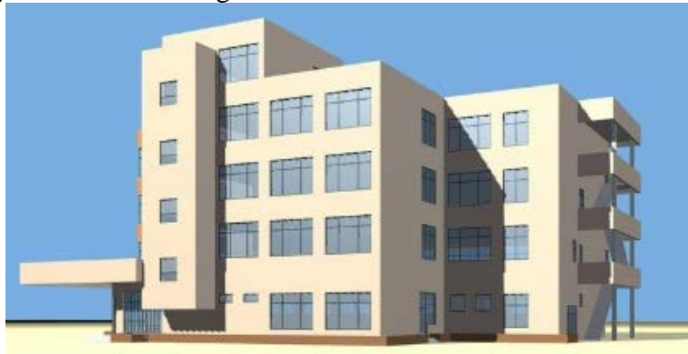
Figure 2 Model-Unity3D rendering

them removes the front, left and right sides, and the other retains the three sides, so that the last two cubes can just be joined together. In this way, the building is hollow. The first half of the building is converted into editable polygons. Many lines are created and then extruded by polygons. The extrusion tool is used to fine-tune the extrusion surface. It is very important to control the numerical value in the process of adjusting. This will determine whether the size of the model and the role interact appropriately. The operation principle of the latter part is the same. Because the building is hollow, it is necessary to make floor splints to separate each floor from each classroom. When the building is roughly outlined, windows need to be made. Because the corresponding windows are in the same position on both sides, a batch of cuboid models are used to run through the whole building to punch the window holes by Boolean order. After the concrete adjustment, a piece of glass material is made, and then the glass accessories are framed, and the windows are fitted to the gap of the building model Bull one by one, and then fine-tuned. The result of model making and importing into Unity3D is shown in Figure 2 below.