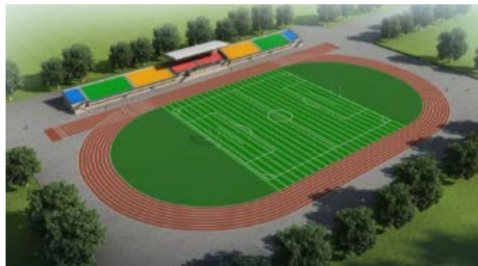
Figure 3 Model 2 Unity3D renderings

In this scenario, the second model is a large and fine model, which consists of plastic runway, football field, rostrum and green fence. The runway and football field are made by line, then rendered and coarsened. The rostrum is an extension of polygon modeling, and then separated into several elements, each element is mapped separately and imported into Unity3D to adjust the reflectivity. In the production of the fence, first build an iron fence, by copying and changing the size and thickness of the position, then rearrange the combination, so as to create a fence, and then combine and copy multiple groups. The model is the most conspicuous model in the whole scene, so it is also the most elaborate in the production. The number of questions in the model of the rostrum, the concave precision of the roof of the rostrum, the large plastic runway are the most delicate. The number of small lengths and wide fences has been made with actual data. The effect chart is shown in Figure 3.